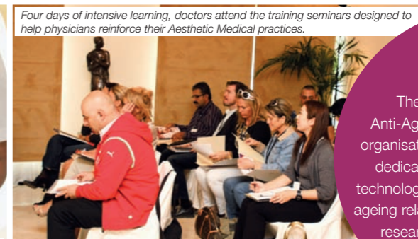
Four days of intensive learning, doctors attend the training seminars designed to help physicians reinforce their Aesthetic Medical practices.