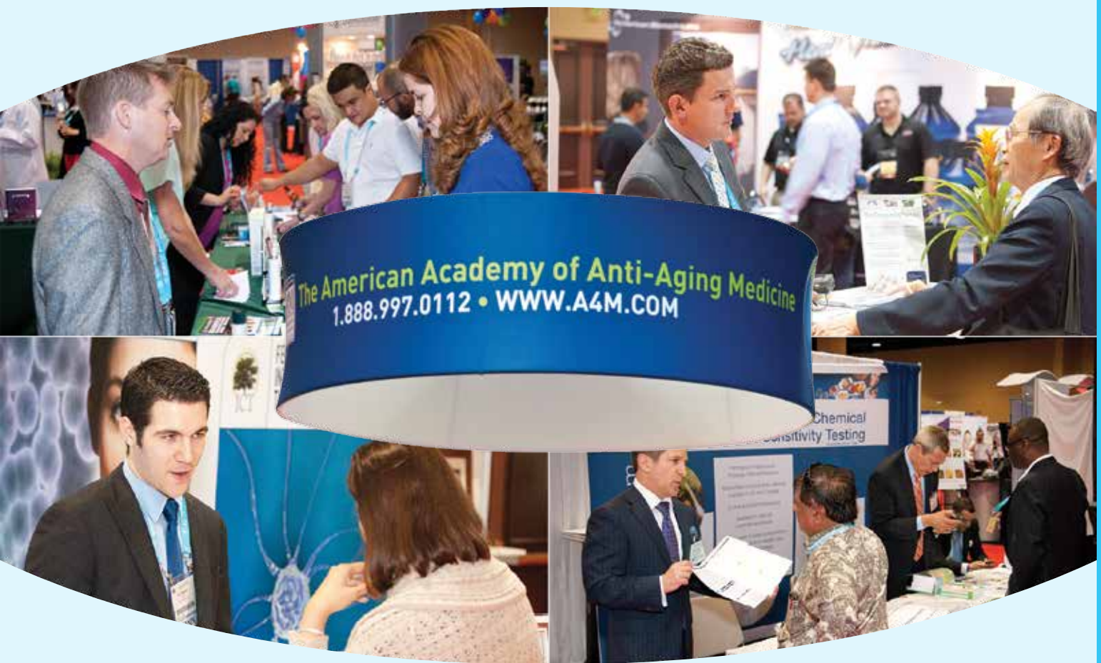
Exhibit Hall Includes